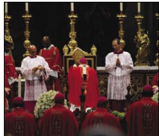
Archbishop Wenski receives the Pallium from Pope Benedict XVI