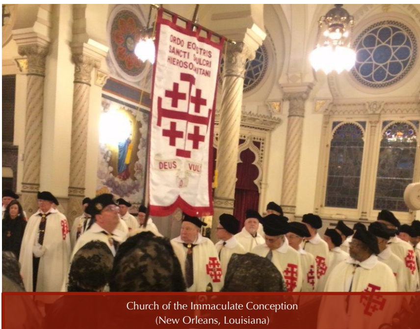
Church of the Immaculate Conception (New Orleans, Louisiana)

Of course, the Saturday black tie and Sunday evening white tie receptions and dinners provided ample opportunity for the newly knighted Chevaliers and honored Dames to don their decorations and join in the festivities. The Saturday evening dinner allows the sections to spend the time at dinner acquainting each other and meeting the new members. Sunday evening saw old and new friends across the various sections meet and share dinner together. As we parted, many offered their assistance at the upcoming event in Miami in 2016.